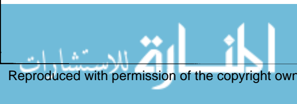
Table VII. Regression of differences between greater than 50 percent and control cohorts

Notes: a Predictors: (Constant), Total support staff cost, Total general operating cost. These regressions continue in Tables VIII and IX